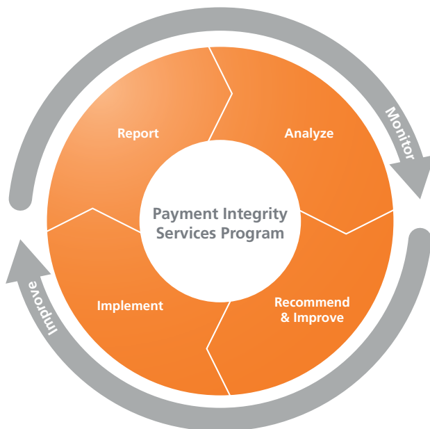
Figure 2 Why Is Payment Integrity a Strategic Imperative